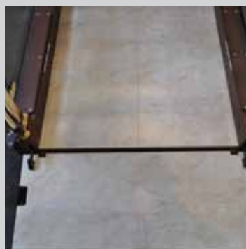
Special Floor Covering