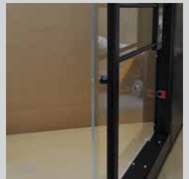
Full Height Side Panels