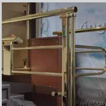
Special Colour Finishes