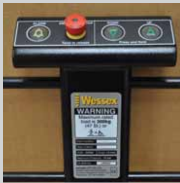
High Spec Controls