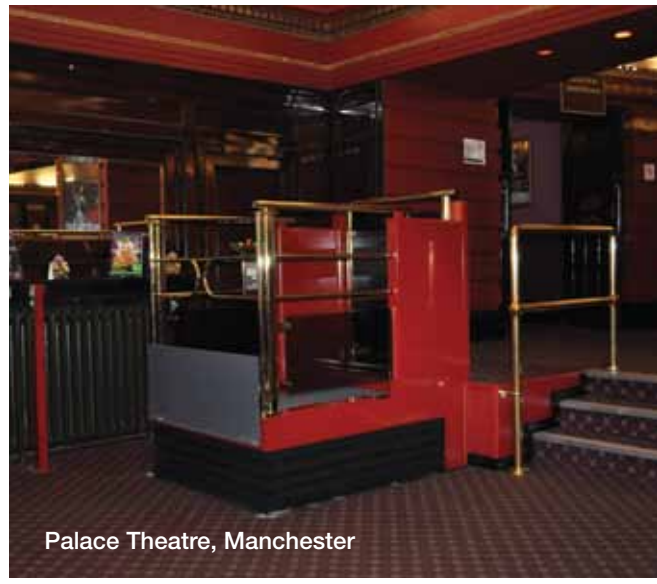
Palace Theatre, Manchester