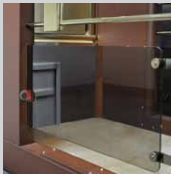
Glass Infill Panel