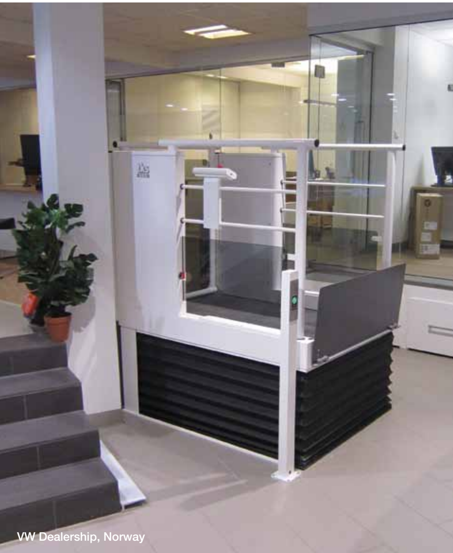
VW Dealership, Norway