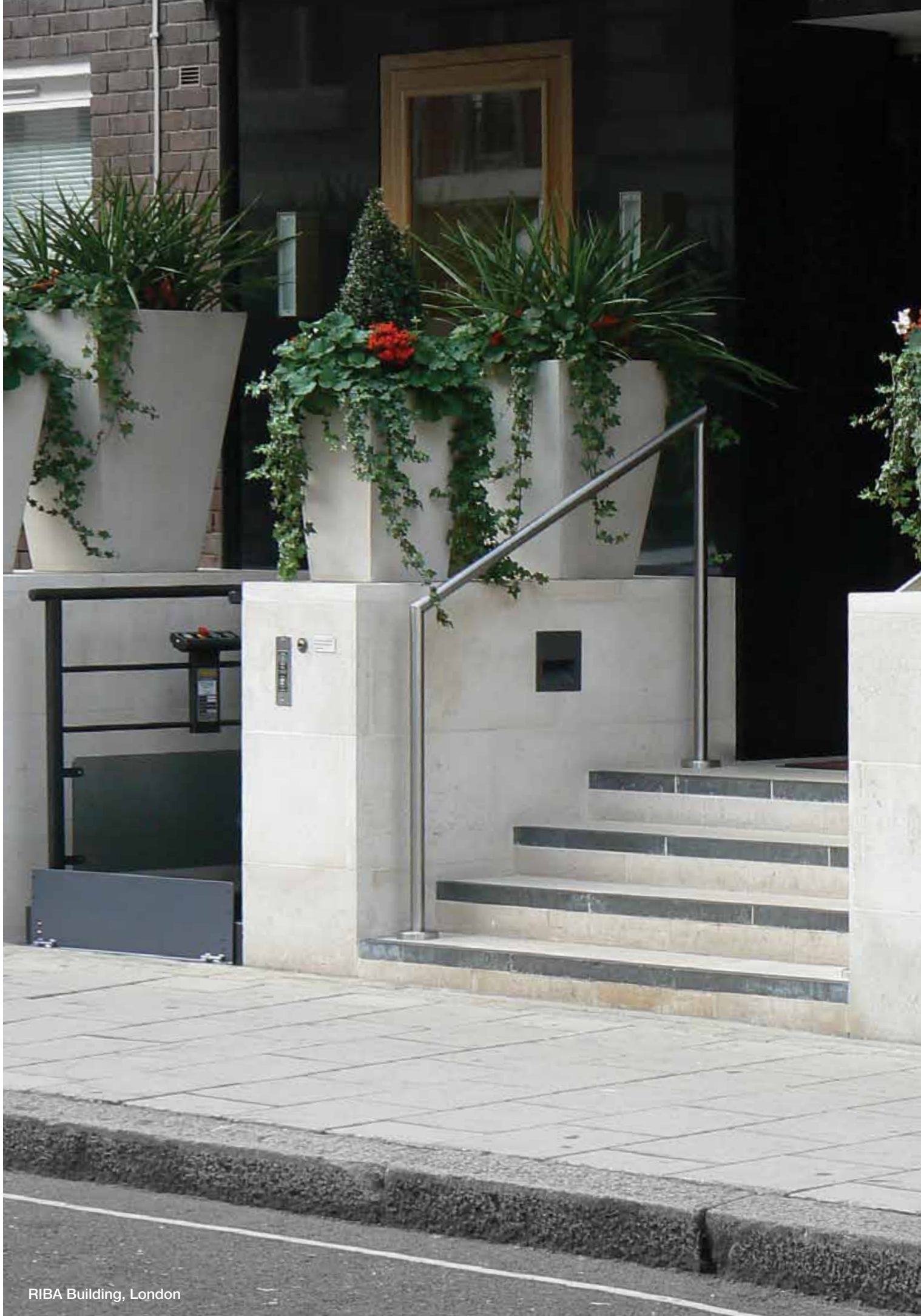
RIBA Building, London