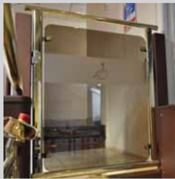
Manual / Power Gates