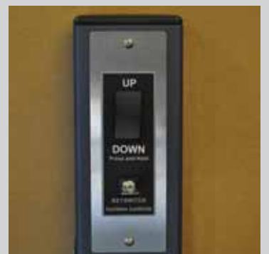
Key Switched Controls